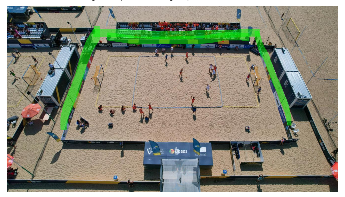
iv. LED advertising boards (at least one long side)

iii. Second row of advertising boards (at least one long side)